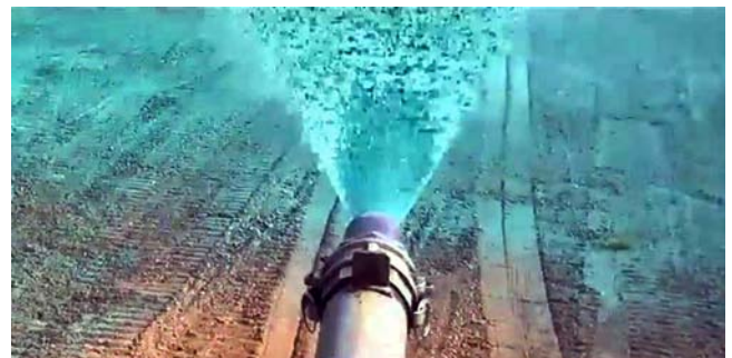
Green PAM (color) applied with cellulose hydroseeding mulch.