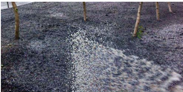
Green PAM applied with cellulose hydroseeding mulch.

* Caution - Do not exceed 4 bottles / 600 gallons as viscosity of the water may clogging / damage spraying equipment.